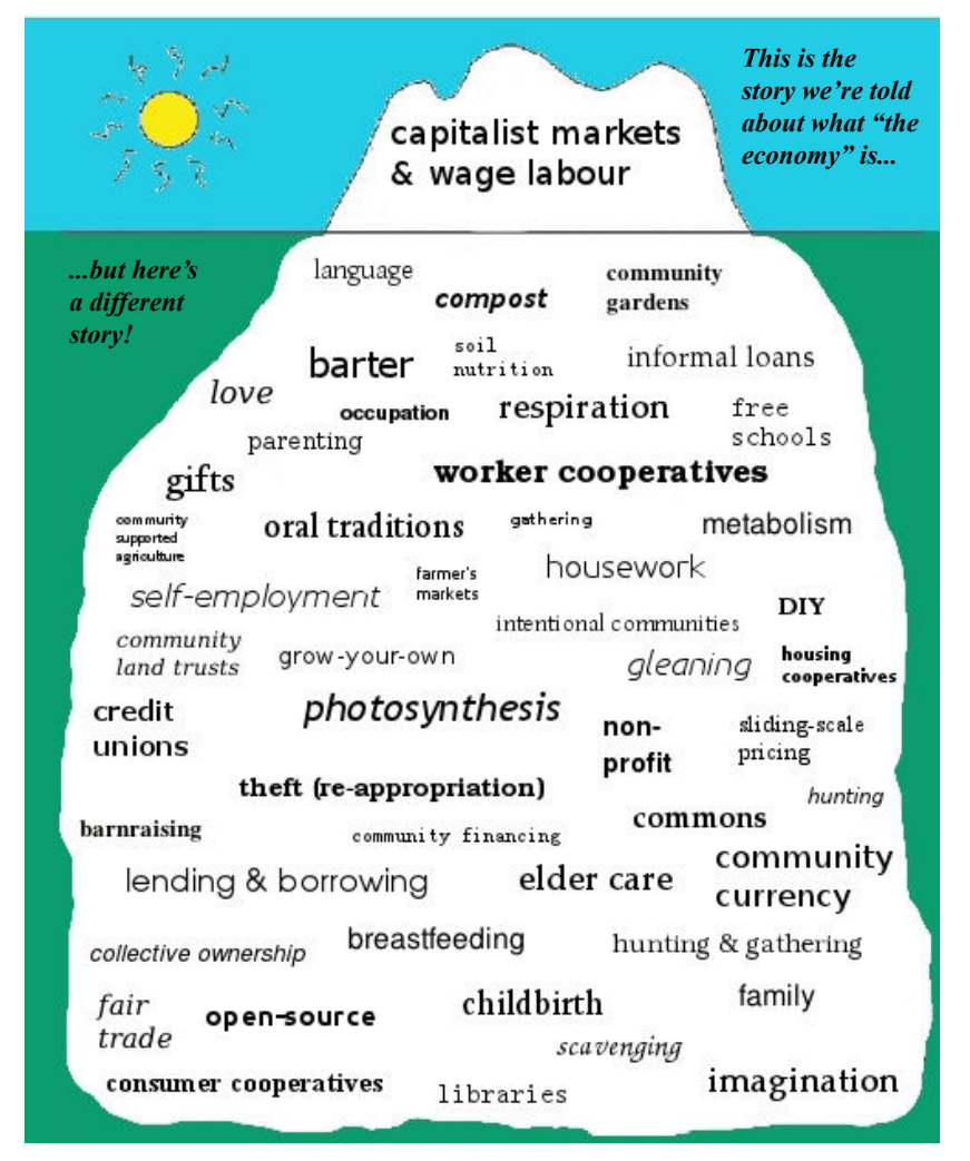
The Iceberg of "Diverse Economies"<sup>9</sup>

The story of "the economy" has hidden from us our possibilities. These are not just imagined, not just fantasies of what might yet be. No: the creative action of generations of economic pioneers has already given rise to a whole array of living possibilities in which we might participate, or on which we might come to depend: worker, consumer and producer cooperatives; community currencies; fair trade initiatives; housing cooperatives and intentional communities; volunteer rescue and fire