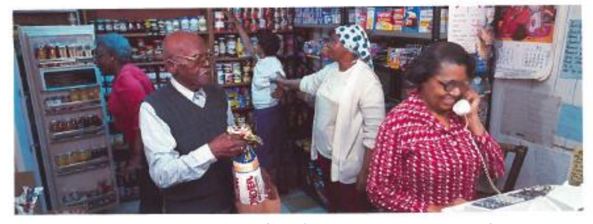
Figure 2: Judiciary Senior Citizens Food Cooperative

Here are the food cooperatives formed in and after 1975: